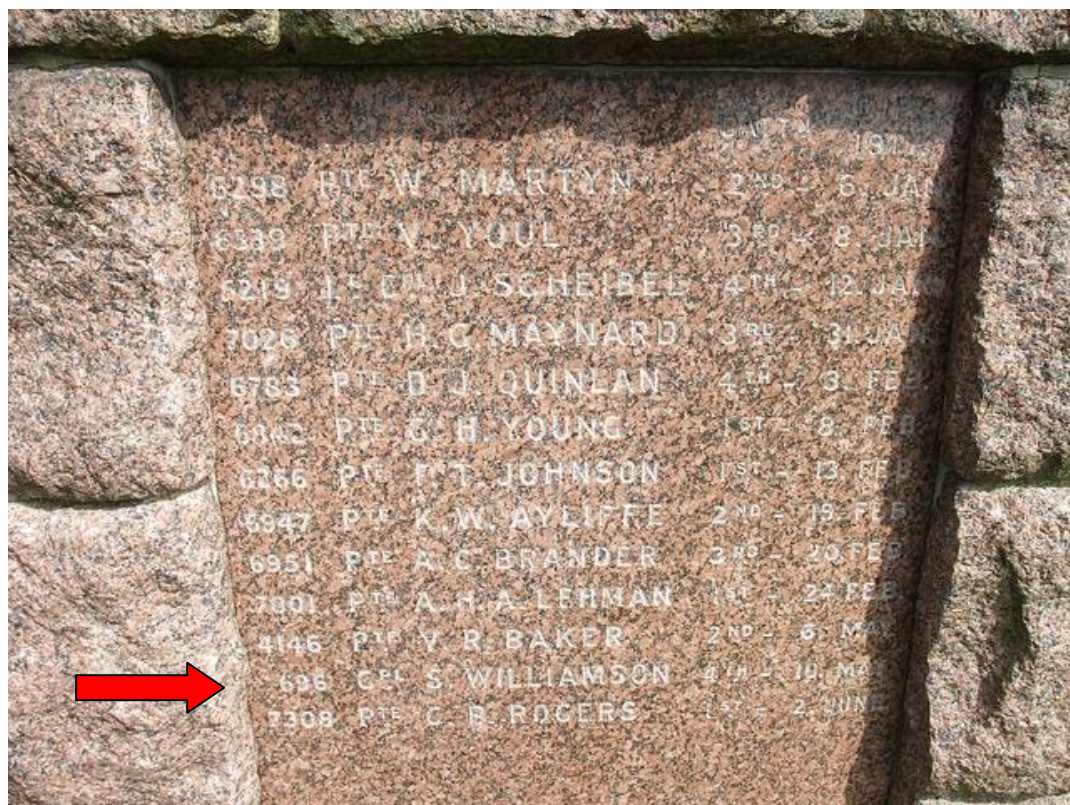
Memorial to 1 st Training Battalion A.I.F. at Durrington Cemetery